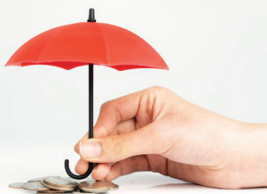
Table of benefits for Death and Permanent Disability

Group term life insurance policy coverage of up to $40,000*